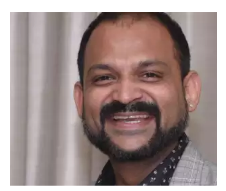
Own Your Being: Acceptance to Ir