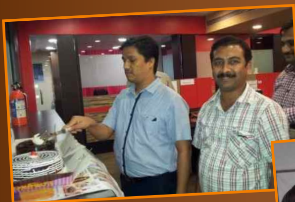
Birthday Bash at Gurgaon Office