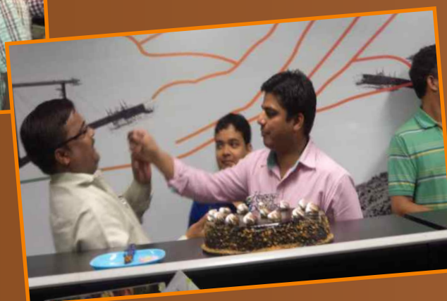
Birthday Bash at Pune Office